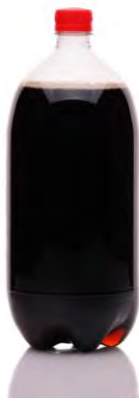
Large bottle (3 litres) £2.80