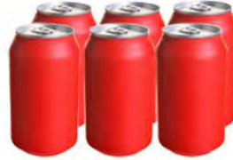
6-pack cans (330 ml each) £1.99