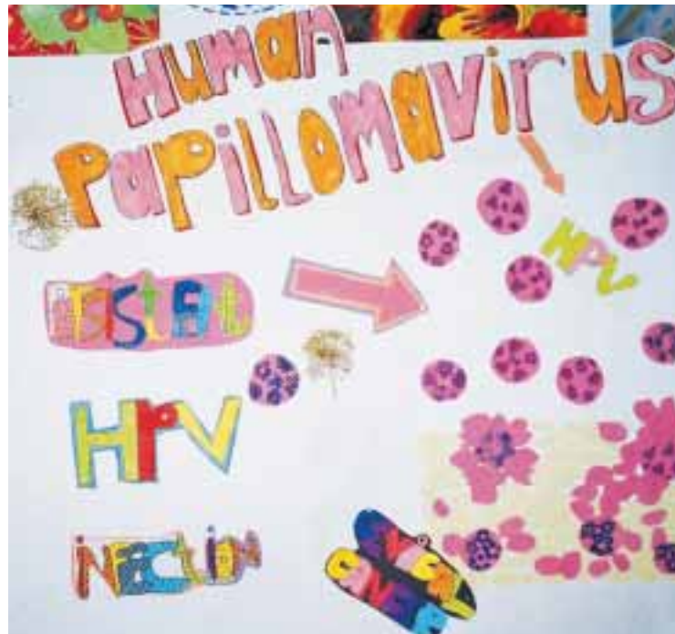
HPV poster designed by children at Wright Robinson Sports College, Manchester